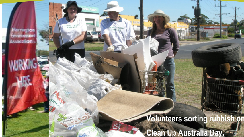
Volunteers sorting rubbish on Clean Up Australia Day.