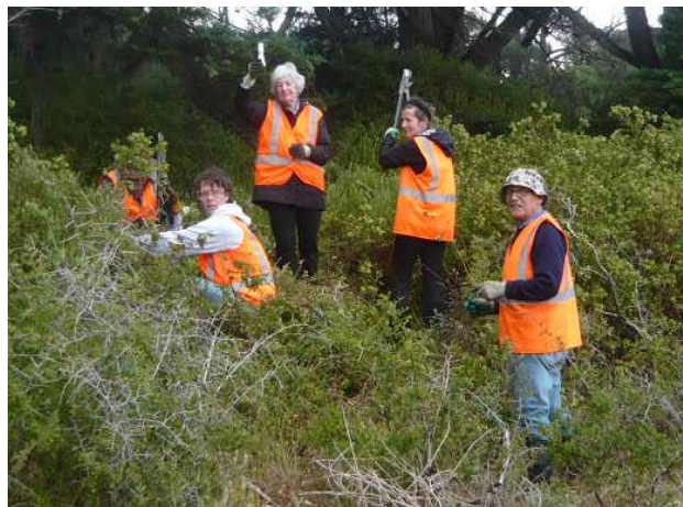
Volunteers weeding at the estuary car park.