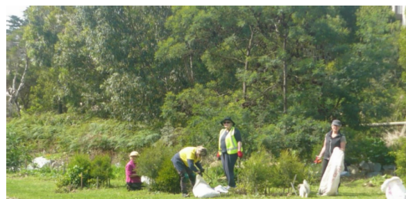
Above: - Friends of Tanti clearing flood debris September

Tanti Creek - Last Sunday of the month 9:30—11:30