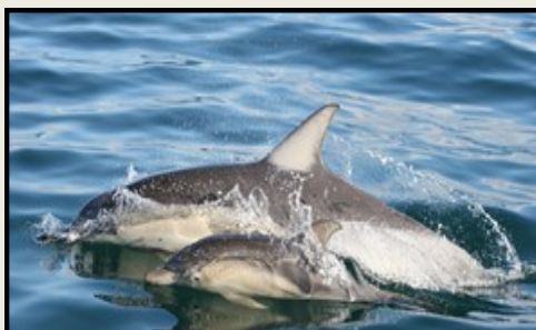
The lead dolphin and her calf off Mills Beach 2007.

They are exceptional here in that they are ocean dolphins, and do get hit by boat propellers, tangled in fishing line, and chased and harassed by boats and by the bigger bottle-nosed dolphins.