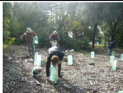
Planting and weeding on one of the coldest Sunday mornings this winter

Federal Government thanked MEA for its report of the Fore-shore Restoration along Mills Beach by working bees. Maintenance of this area will continue into 2014.