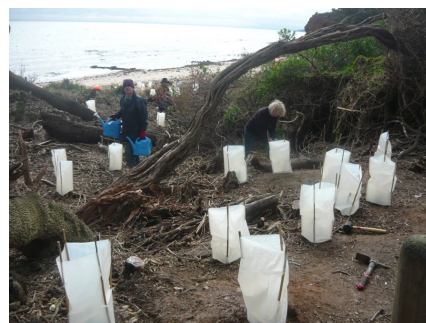
August planting on Shire Hall Beach, the first time this area has been restored.

Friends of Mills Beach meet every month at various sites along Mills Beach, Shire Hall Beach and Scouts beach and on Red Bluff. In 2016, Scouts beach has been replanted with spinifex and some trees, replacing those that had