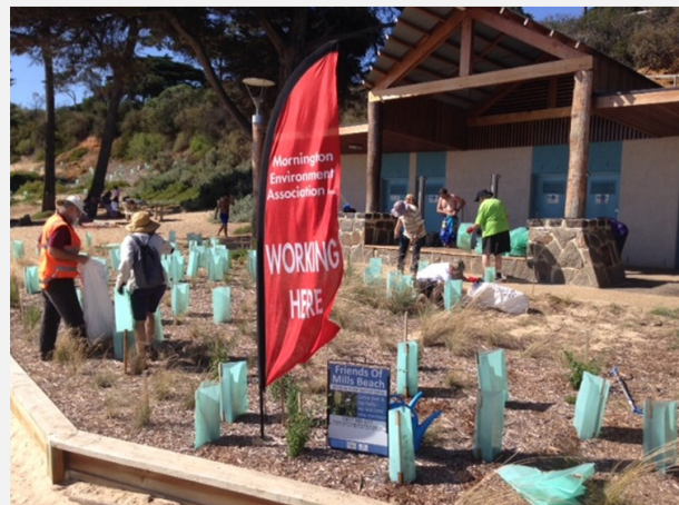
Checking and weeding recently planted beds in front of the new toilet block at Mothers Beach. Green Army did the original planting but Friends of Mills Beach have done the maintenance, watering and plastic guard monitoring.