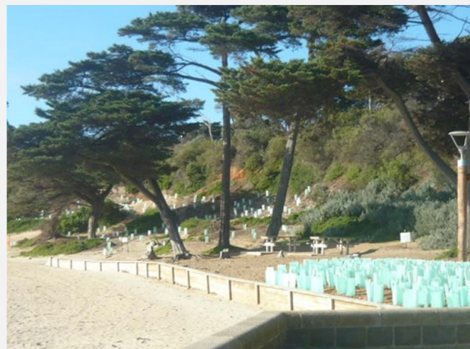
Mothers Beach, a "Sea of Green", is the site for our AGM this year. Come and join us, eat your fish and chips and hear our reports.