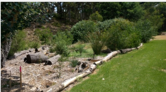
Stones Feb 2018