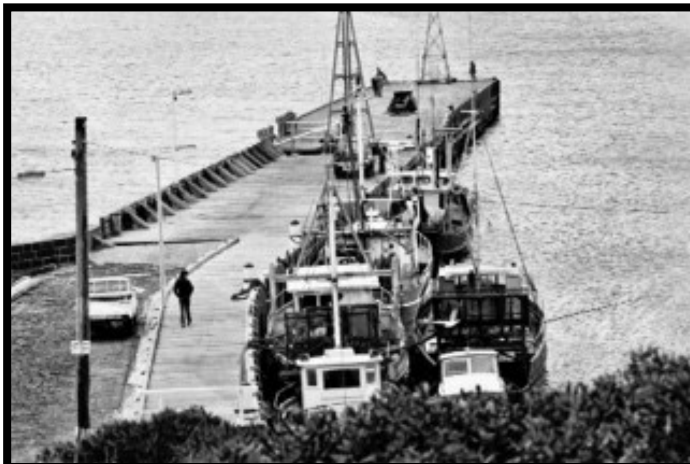
Old photo showing the Mornington Pier in earlier days .