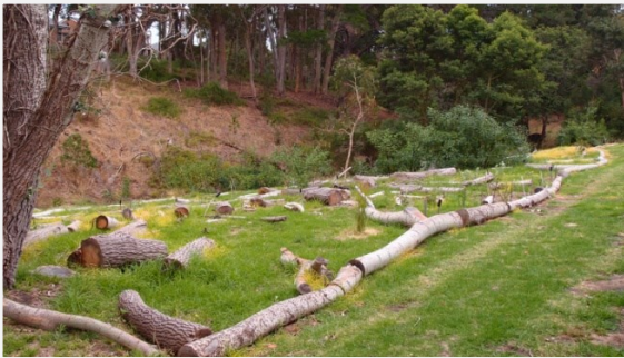
Stones Jan 2017