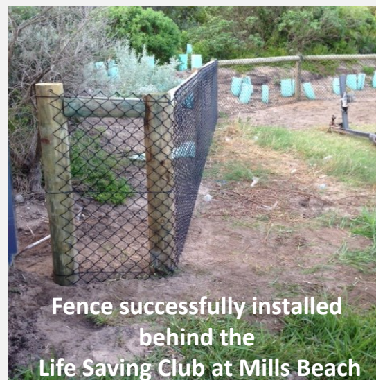
Fence successfully installed behind the Life Saving Club at Mills Beach