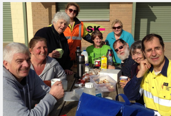
Welcome coffee break for the hard working team at Mills Beach