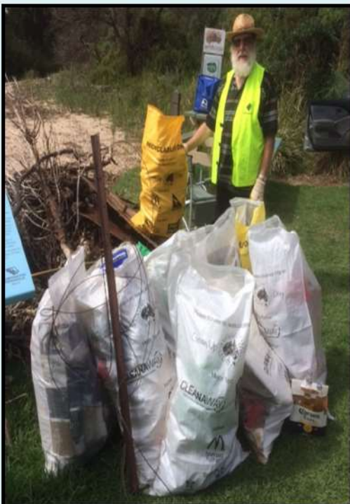
Counting and securing the rubbish collection.

This National Annual Clean Up Day at Mills Beach was coordinated by MEA on 7th March 2021. Twenty eight adults and more than eight children volunteered their time, with ages from 4 years to 83. Of the adults there were 13 males and 15 females.