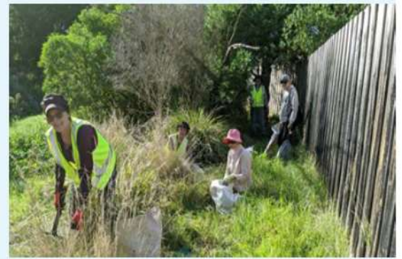
Hand weeding by Tanti Creek Friends

Tanti Creek Friends Eleven dedicated Friends removed weeds and fallen branches from the path between our Creek Rd and Hospital sites. 21 bags of weeds were collected! We are also working on the Litter Source Reduction Project with Melbourne Water and planning additional plantings at Strattons Lane.