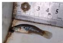
Eastern Gambusia – Mosquito Fish