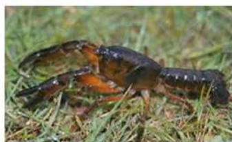
Fresh water burrowing crayfish