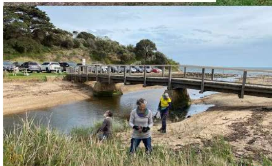
Mills Beach Friends - planting