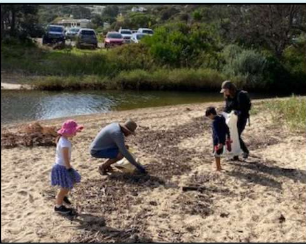
Family on the job