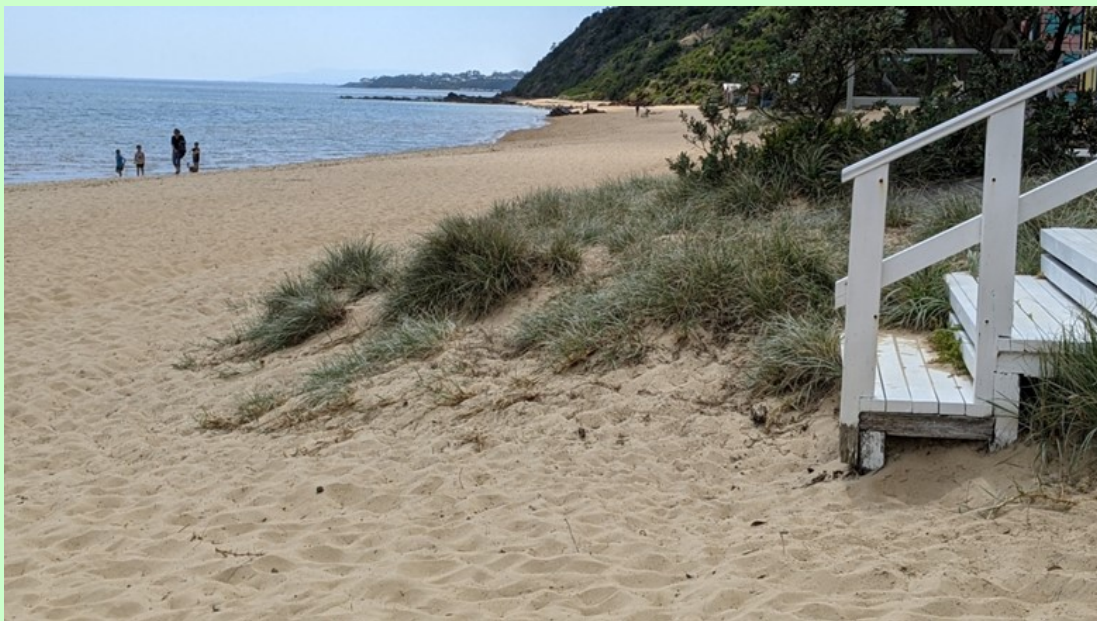
Spinifex stabilizing sand on Mills Beach

All vegetation on Mornington foreshores is protected and cannot be pruned or removed without a permit. Spinifex grasses play a particularly important role. They stabilise the ground and prevent sand erosion thus protecting our beautiful beach and our iconic landmark boat-houses. Please don't remove any Spinifex or make new tracks through spinifex patches.