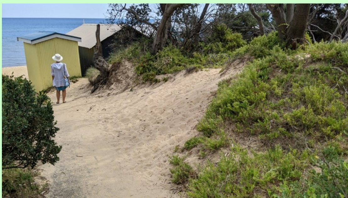
Sand blowing onto the Herbert St path where vegetation cover has been lost